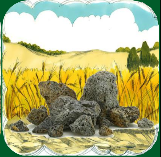
The Parable of the Sower